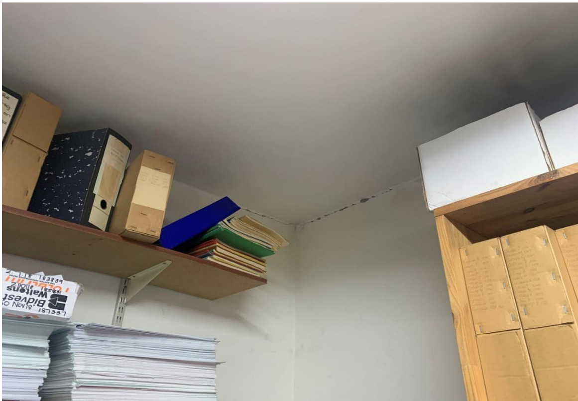
Figure 4: Cracks in the storage safe.