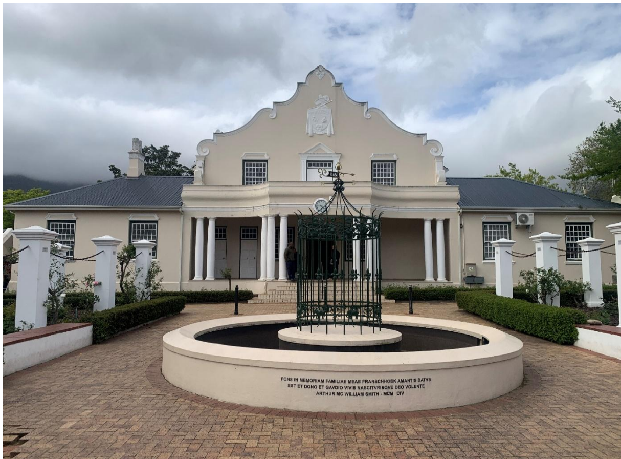
Figure 2: Front of the Townhall