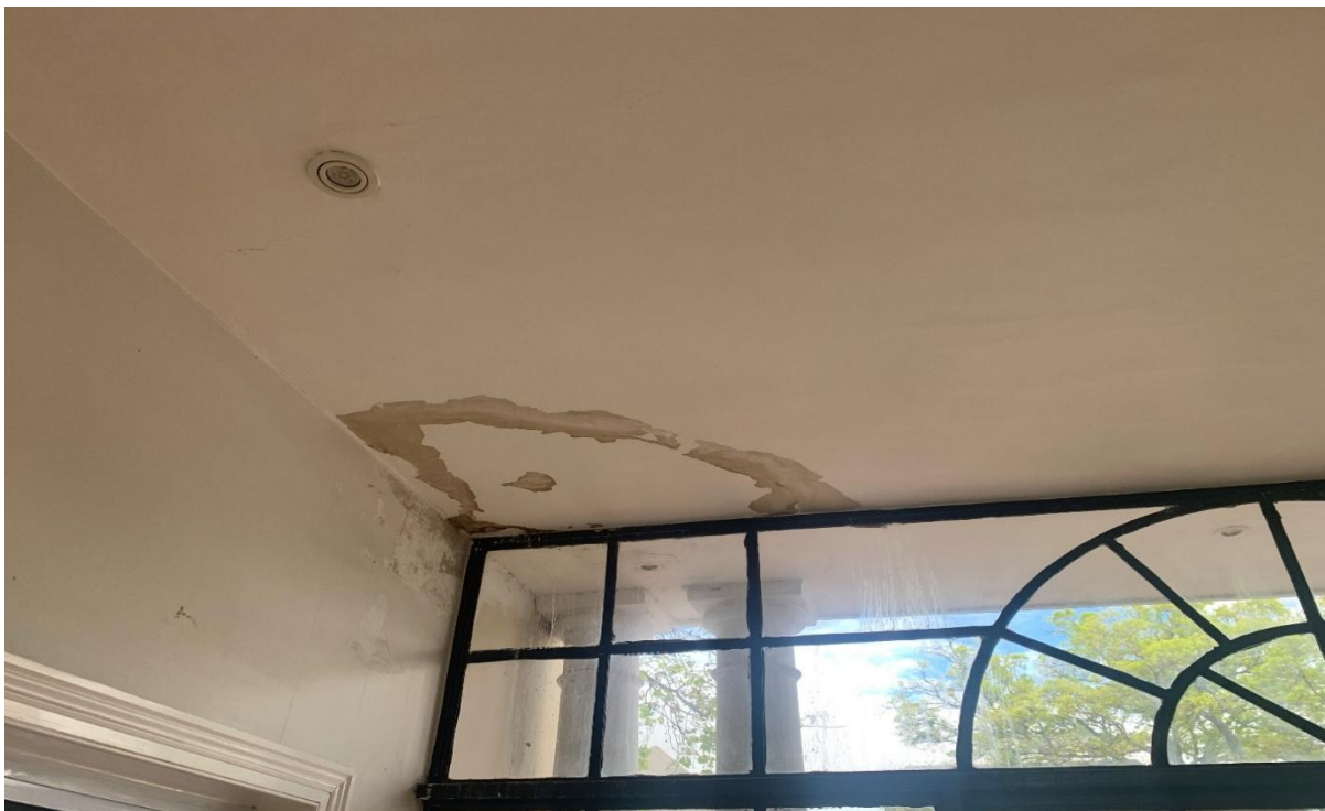
Figure 12: Damped ceilings