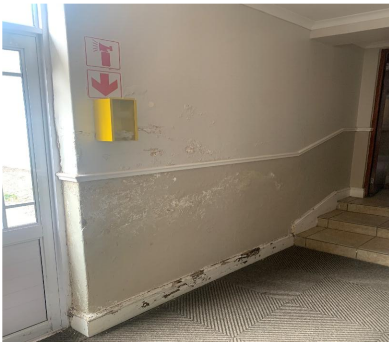
Figure 8: Damped walls and rotten timber skirting