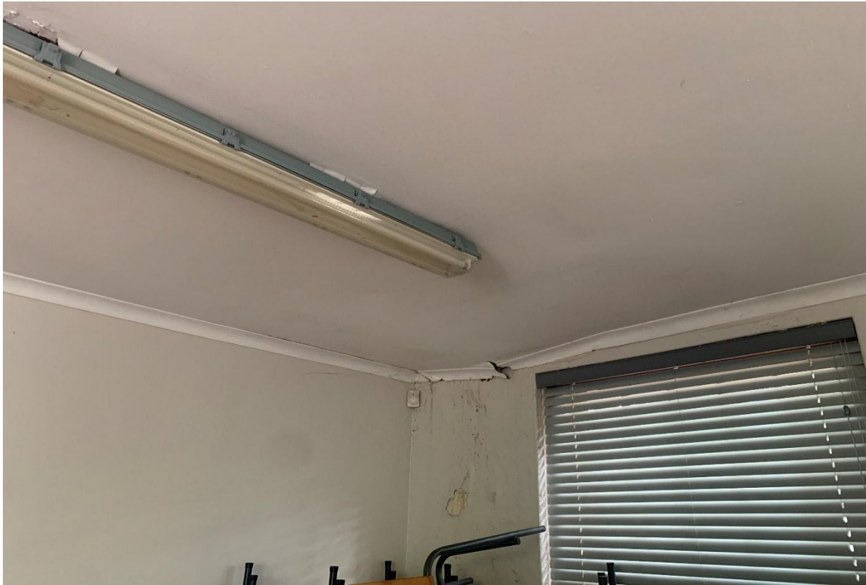
Figure 7: Old electrical (light) fitting and damaged ceiling and cornice.