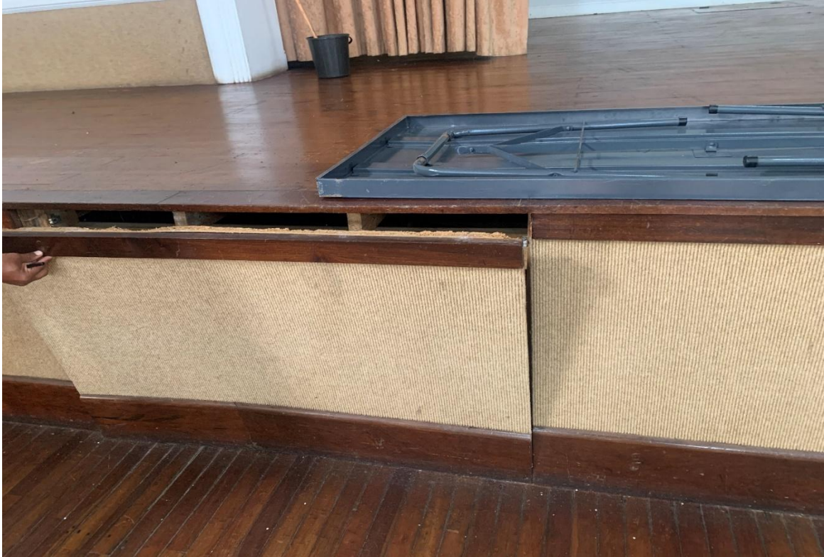
Figure 14: Loose/ broken stage panel.