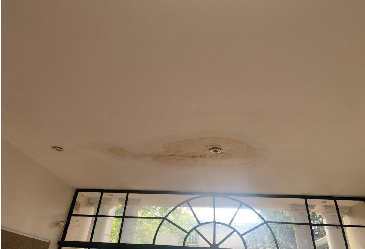
Figure 12: Damped ceilings and water leaks through light fittings