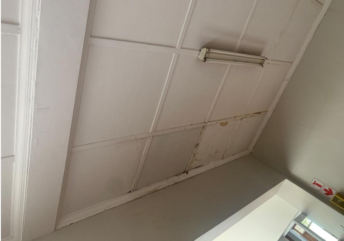
Figure 15: Rusted light fitting due to water leaks