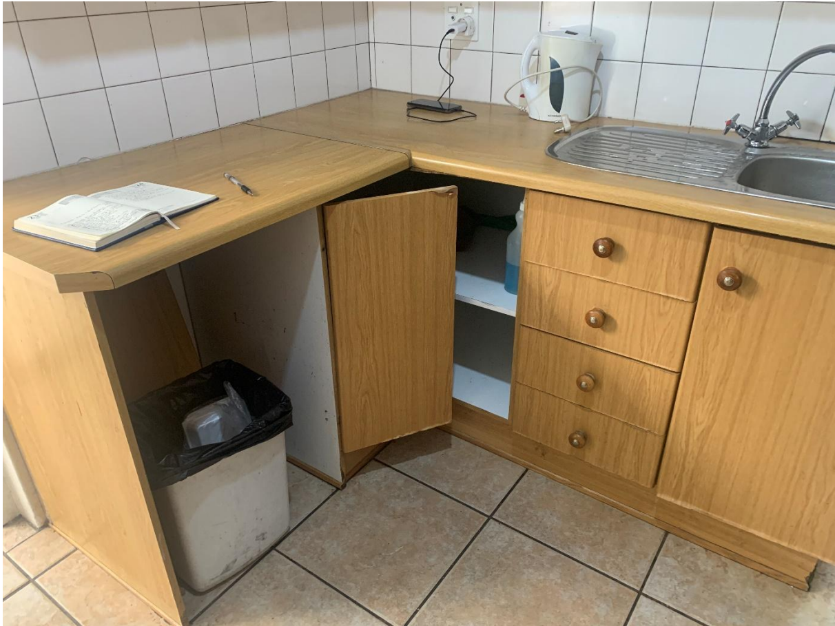
Figure 11: Old and rotten kitchen carboards