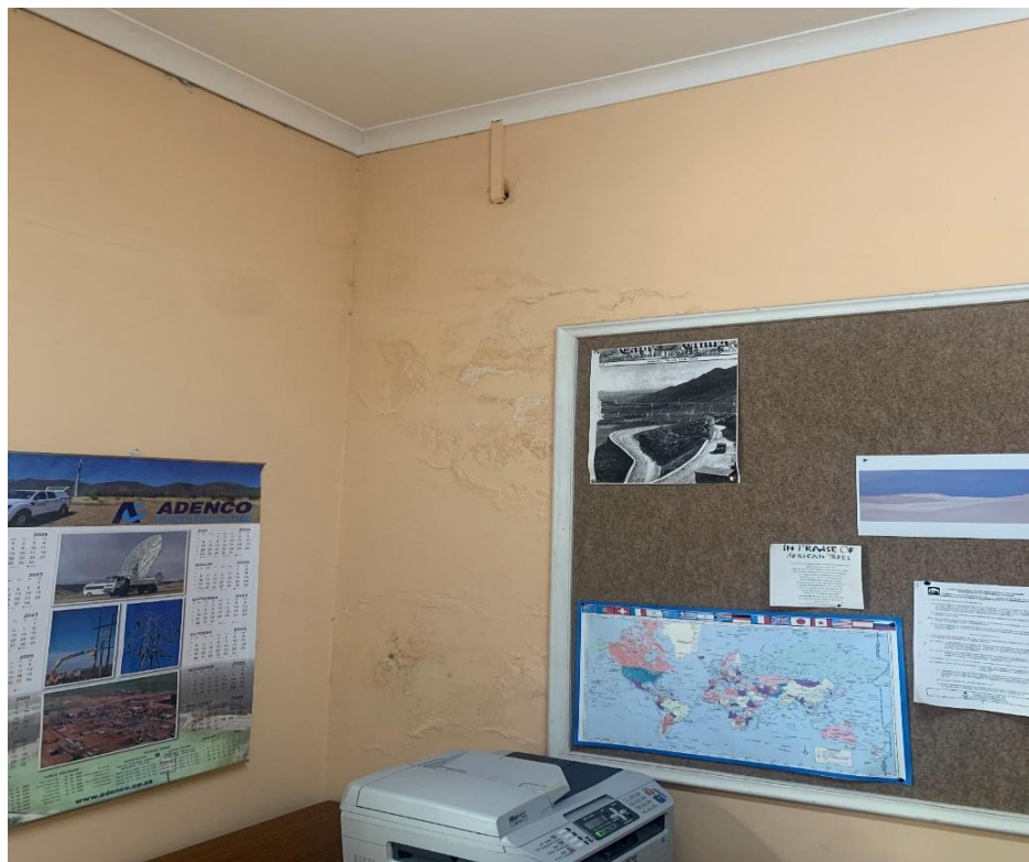
Figure 6: Damped walls