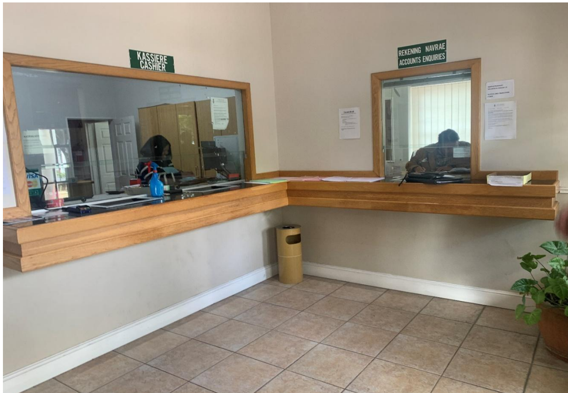
Figure 5: Cashiers area that must be redesigned to make it disability accessible