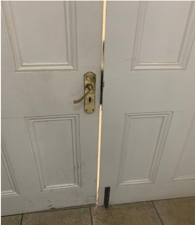
Figure 10: Broken lock and door do not close properly