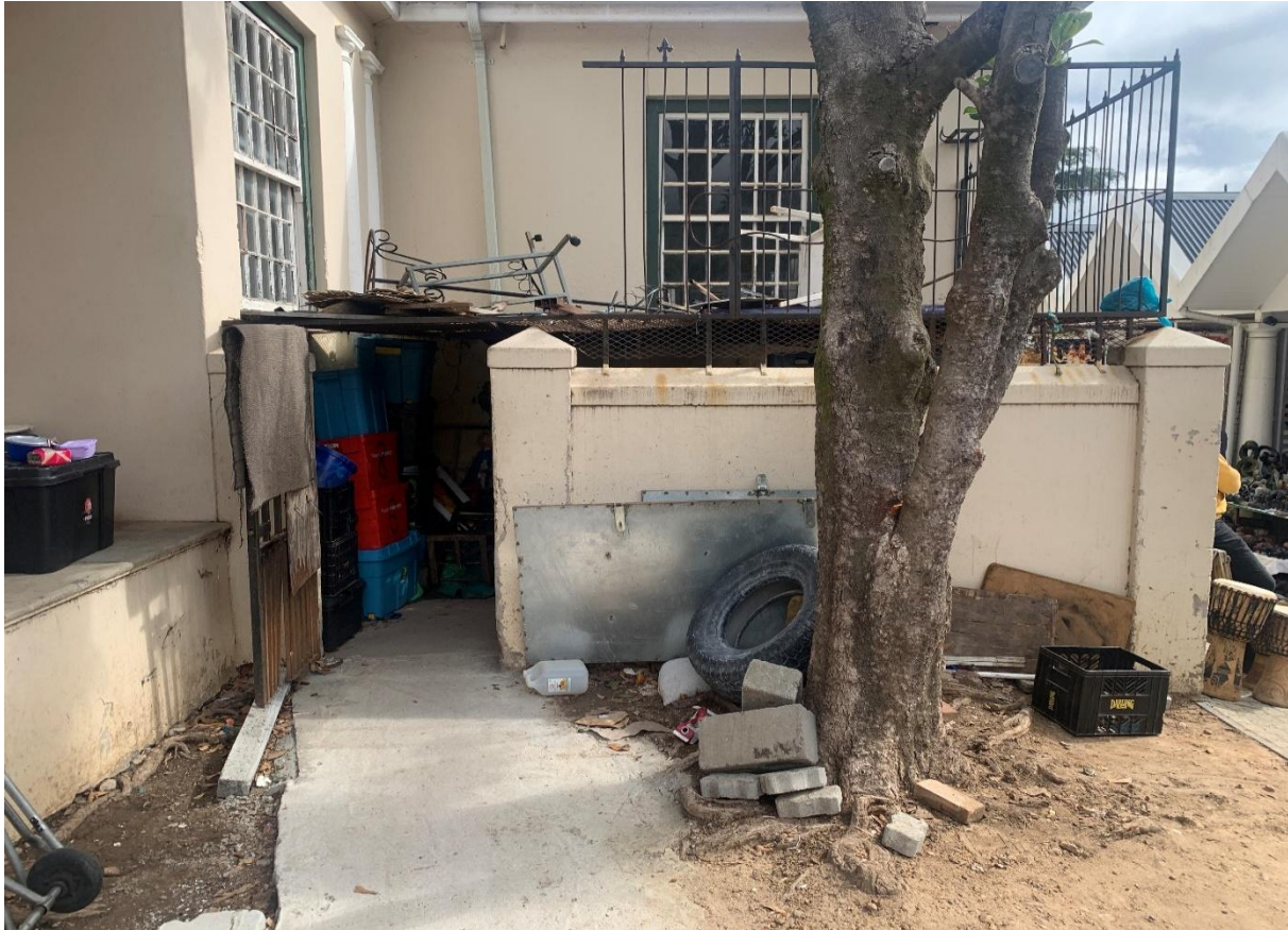
Figure 16: Wheelie bin storage area