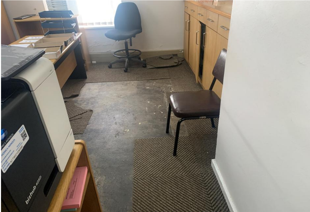
Figure 3: Old and loose carpets