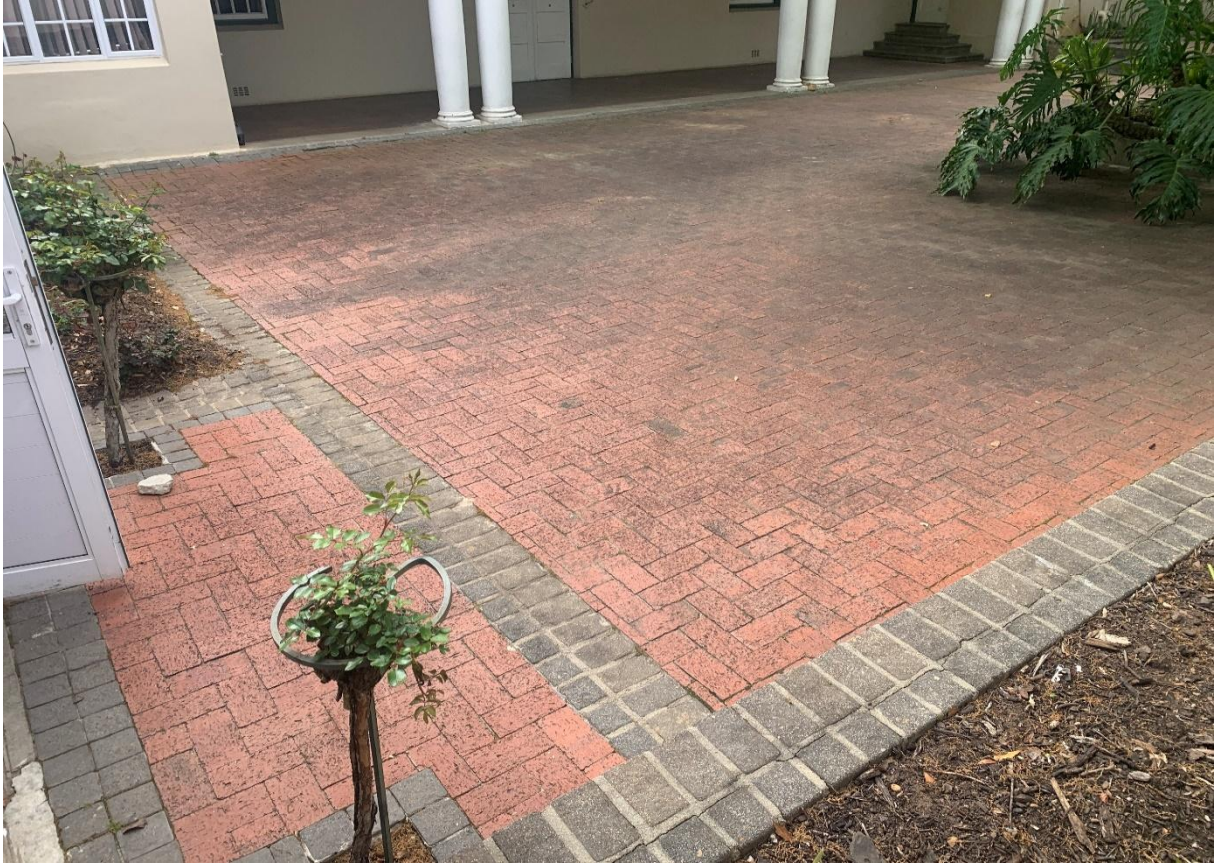
Figure 9: Paved courtyard