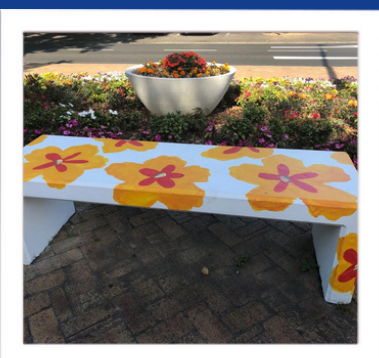
Seen around town, 'Benches in bloom project for Garden town these were decorated by pj Oliver art school