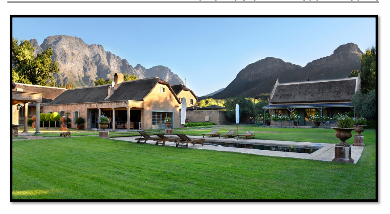
Figure 4: The main dwelling and Garden cottage that will form part of the tourist accommodation establishment