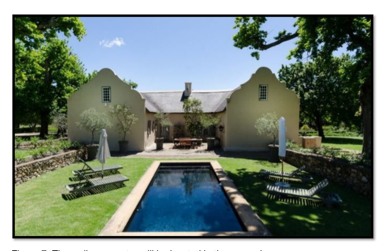
Figure 7: The wellness centre will be located in the manor house