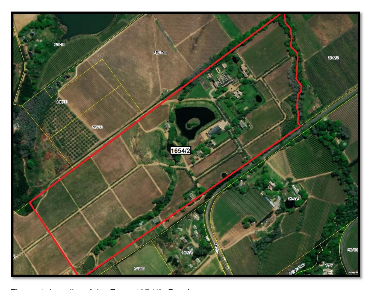
Figure 1: Locality of the Farm 1654/2, Paarl

The subject property is located \pm 2 km south of Franschhoek central, on the Excelsior Road. See Figure 1 below and the locality plans attached hereto (see Section C ).