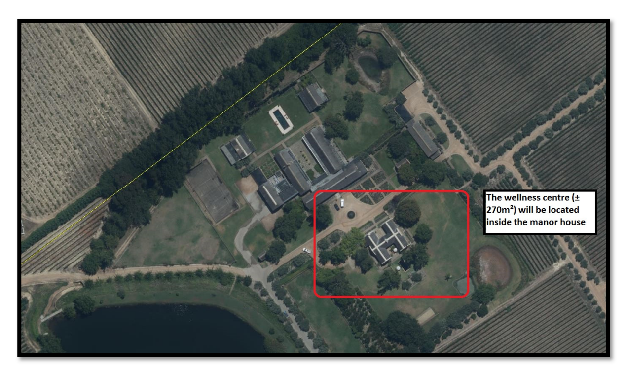
Figure 5: The proposed tourist facility (wellness centre)

As mentioned above, the wellness centre will not be open to the general public. Guests will have to stay in the guest house to have access to the wellness centre. For this reason, a minimum of 11 guest bedrooms are needed to make the wellness centre a viable development option. Photographs of the existing farm building that will be internally converted into a wellness centre (manor house) are included – see Figures 6 and 7 below.