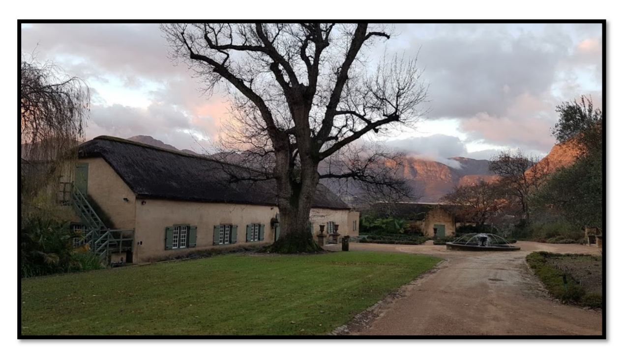
Figure 3: The main dwelling will be converted into a tourist accommodation establishment