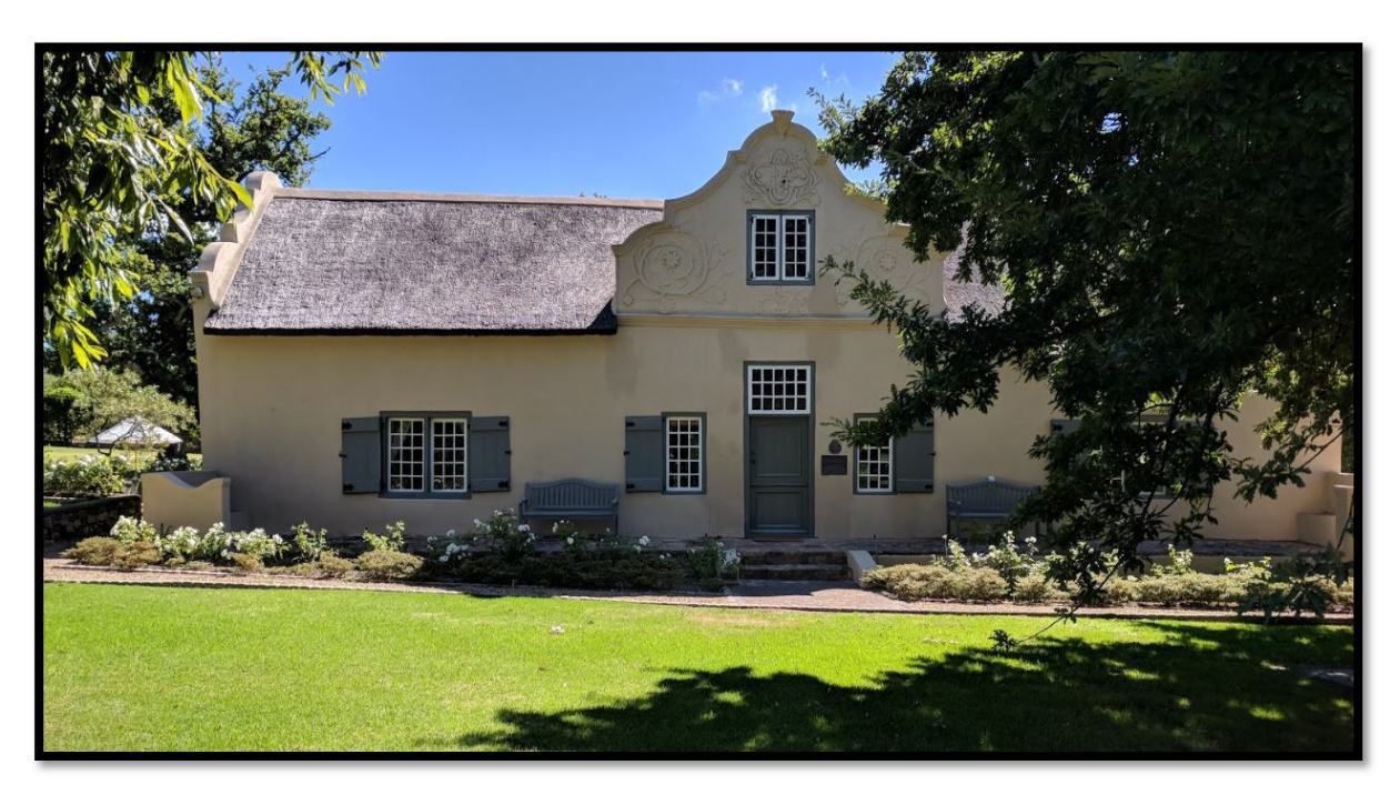
Figure 6: The manor house that will accommodate the wellness centre