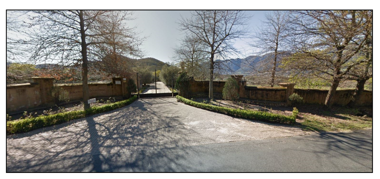
Figure 8: Existing access to the subject property