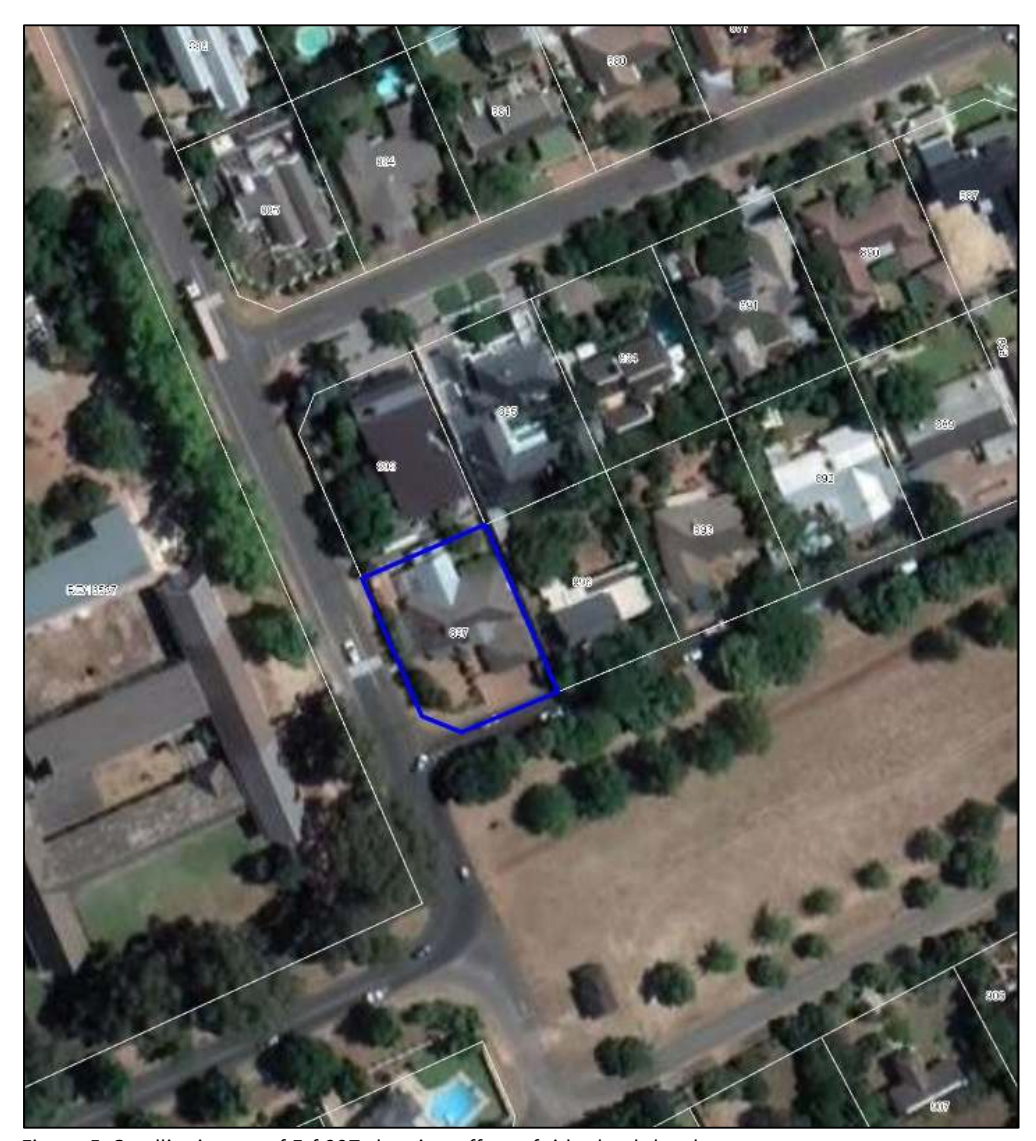
Figure 5: Satellite image of Erf 897 showing effect of title deed development parameters

users, who would typically only occupy the business space between peak periods. Such home occupation use is not in keeping with the definition as in the ZSB, as it is not the proprietor occupying the property, but rather an employee or otherwise related person. The situation along the main feeder roads, especially in view of the envisaged doubling thereof as indicated in the RMP needs to be considered holistically and the properties should be permitted to rezone to more appropriate uses as also provided for in the Adam Tas Corridor proposals.