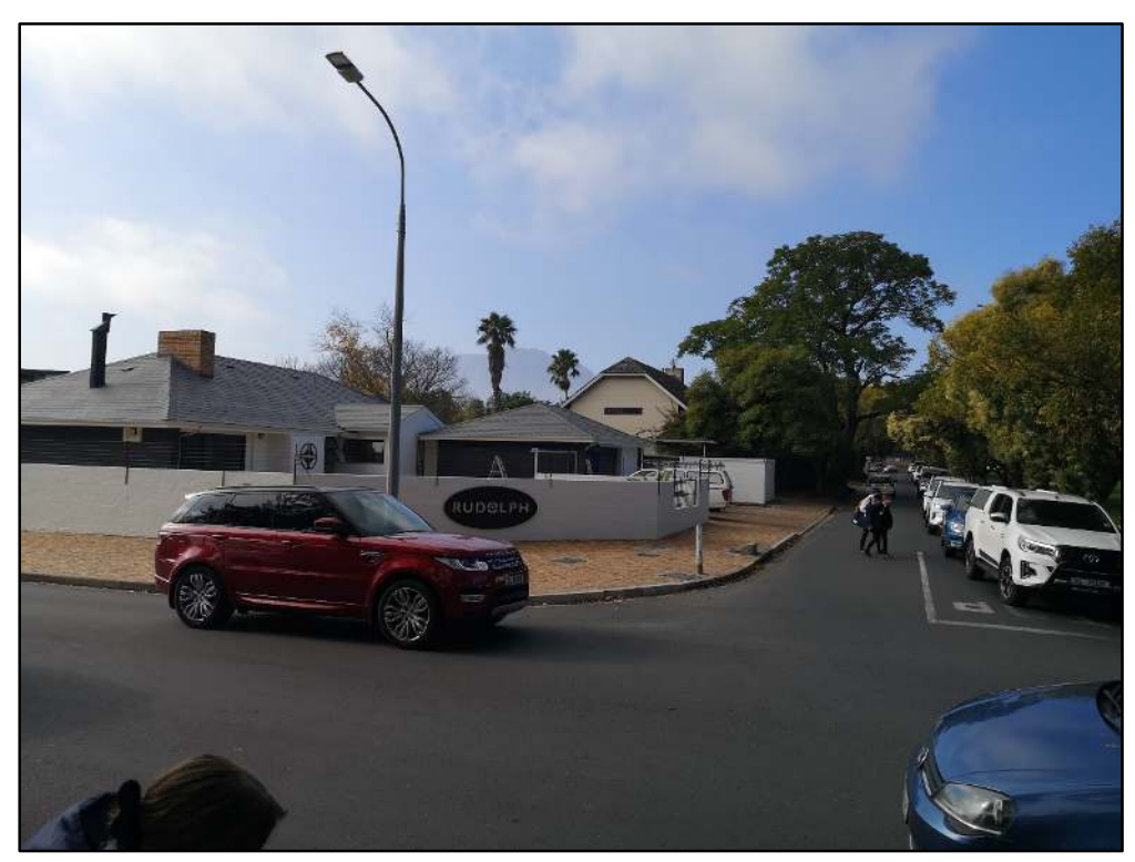
Figure 2: Erf 897 access during school peak

Thus, understandably, the property is no longer an ideal single dwelling residential use property, it being located on the intersection where school traffic further exacerbates the situation. On the other hand, its location within walking distance of the CBD, the University, and the schools of the surrounding area, makes it an ideal venue for densification, e.g., by the addition of a second dwelling, subject to the removal of the restrictive title conditions.