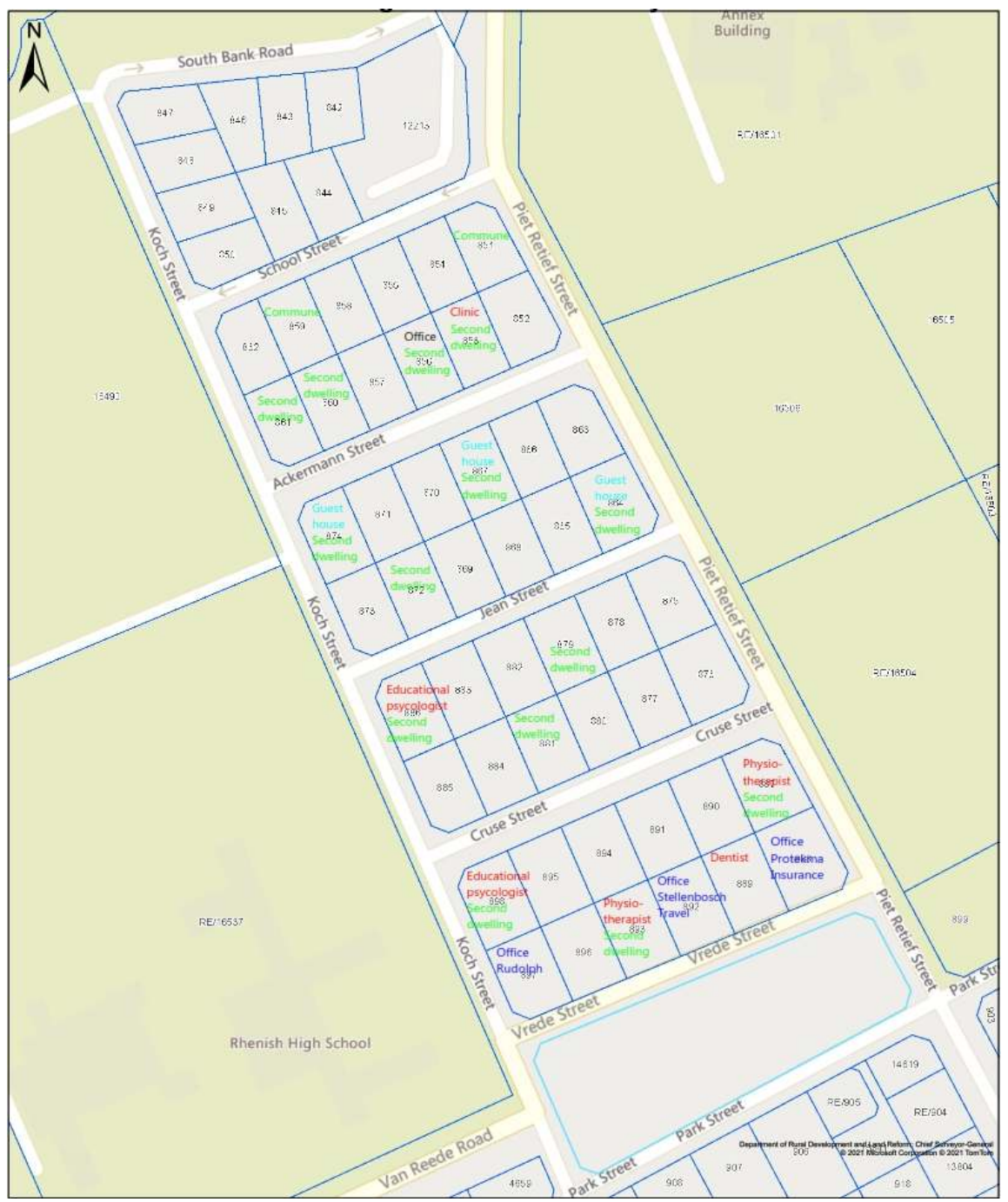
Figure 3: Krigeville area land use map

Some of the title deed restrictions are related to land use management, given that the conditions were imposed by the Administrator when approving the development in terms of the Townships Ordinance, 1934, Ordinance 33 of 1934. These conditions could be removed, suspended, or relaxed where a zoning scheme is in effect.