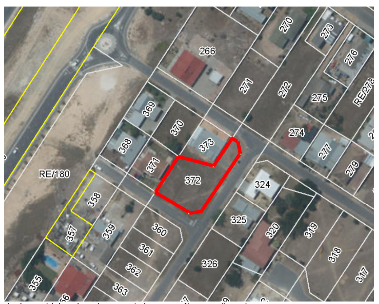
The above aerial photo shows the property in the contexts of its surrounding environment