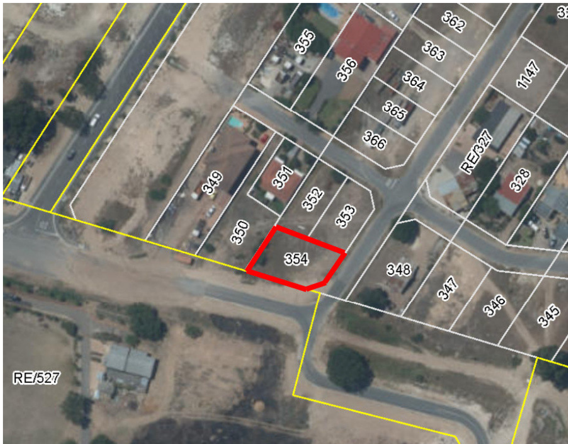
The above aerial photo shows the property in the contexts of its surrounding environment