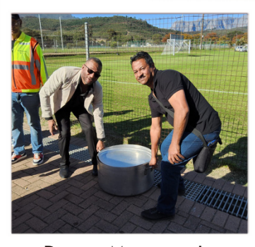
Deputy Mayor at the Stellenbosch Mass Iftaar.