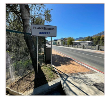
The the reopening of the Distillery Road Bridge. (Steenenbrug)