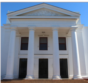
Changes to the Mayoral Committee