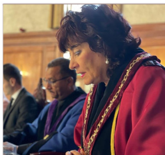
The municipal budget and IDP was passed by Council at the end of May