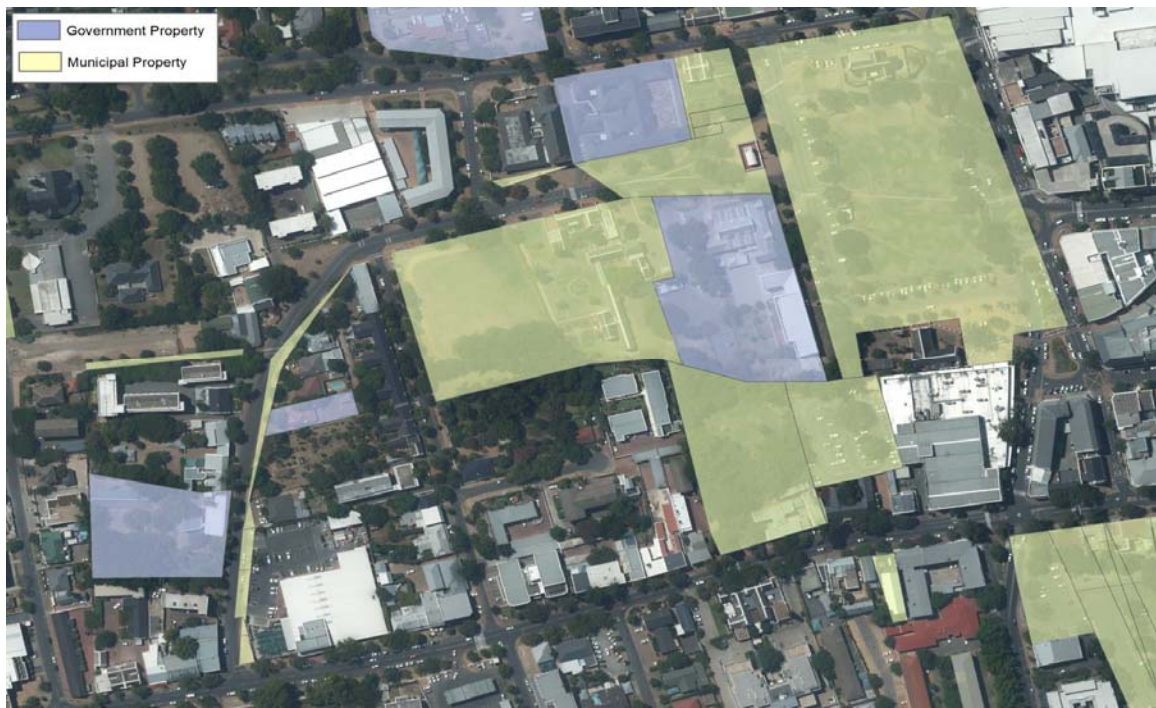
Figure 3: Land ownership of the Rhenish complex and surrounds

The focus of this discussion relates specifically to the two gardens in the Rhenish Complex namely the Patronage front garden facing Market Street and the Voorgelegen Binnetuin. See the location of these gardens in figure 2 .