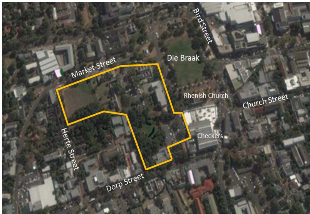
Figure 1: The location of the Rhenish complex in central Stellenbosch

The Rhenish complex comprises of a grouping of historic buildings and associated spaces and gardens bounded by Market Street, the Braak, Herte Street and Dorp Street in central Stellenbosch.