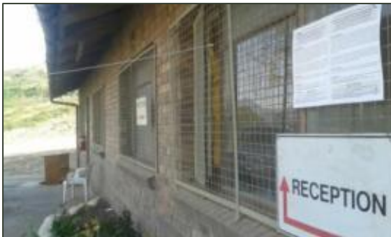
Figure 4: Stellenbosch Landfill site office