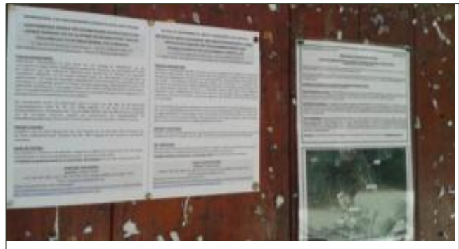
Figure 5: Erected outside on Stellenbosch Library notice board