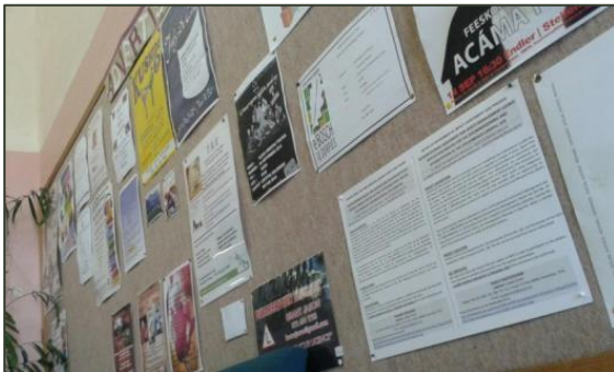
Figure 6: Erected inside on Stellenbosch Library notice board