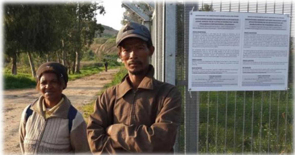
Members of the informal Slab Town Community located on the Stellenbosch Landfill Site in front of one of the project site notices

Sonja Pithey Consulting Environment- Integration – Participation-