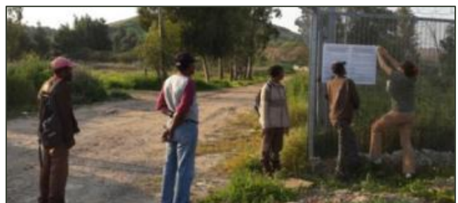
Figure 3: Notice board erected at entrance to Slab Town Community off Adam Tas Road