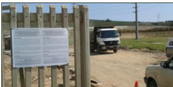
Figure 2: As above